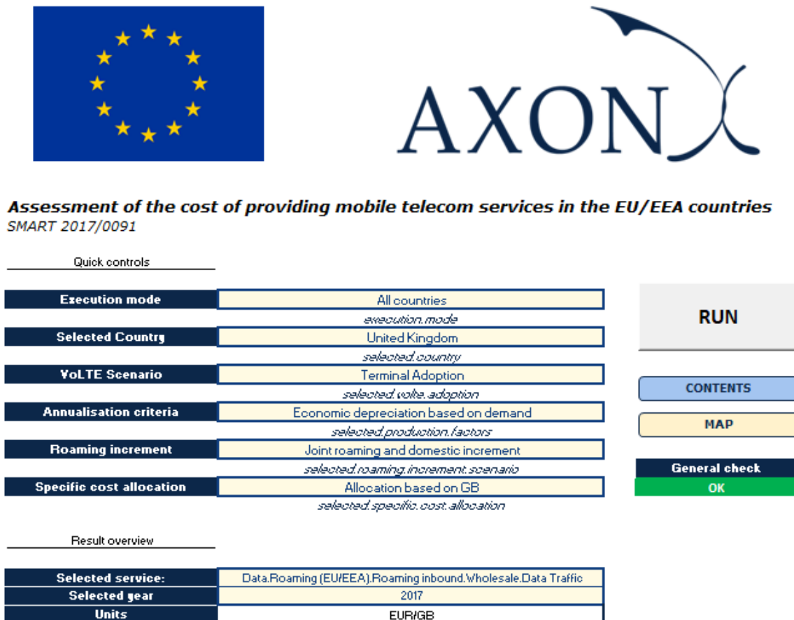
Exhibit 4.1: Snapshot of the control panel

The control panel (or COVER) represents the main interface of the model to the user. This worksheet is used to select the model’s main available options, configure the execution mode and run the model. The following figure shows a snapshot of the control panel.